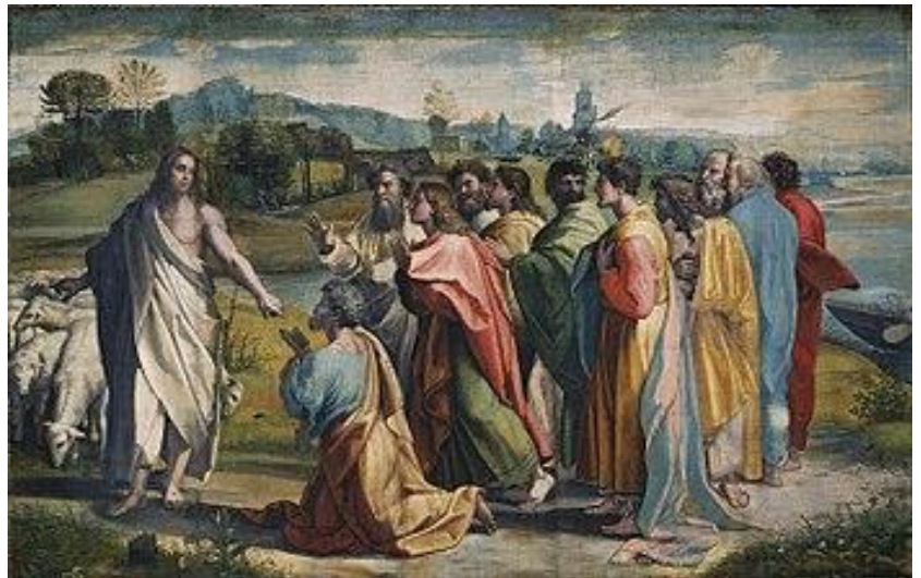
Raphael, Christ's Charge to Peter, 1515 2

St. Peter denied Jesus 3 times. Yet after the resurrection, Jesus gave Peter 3 chances to affirm his love.